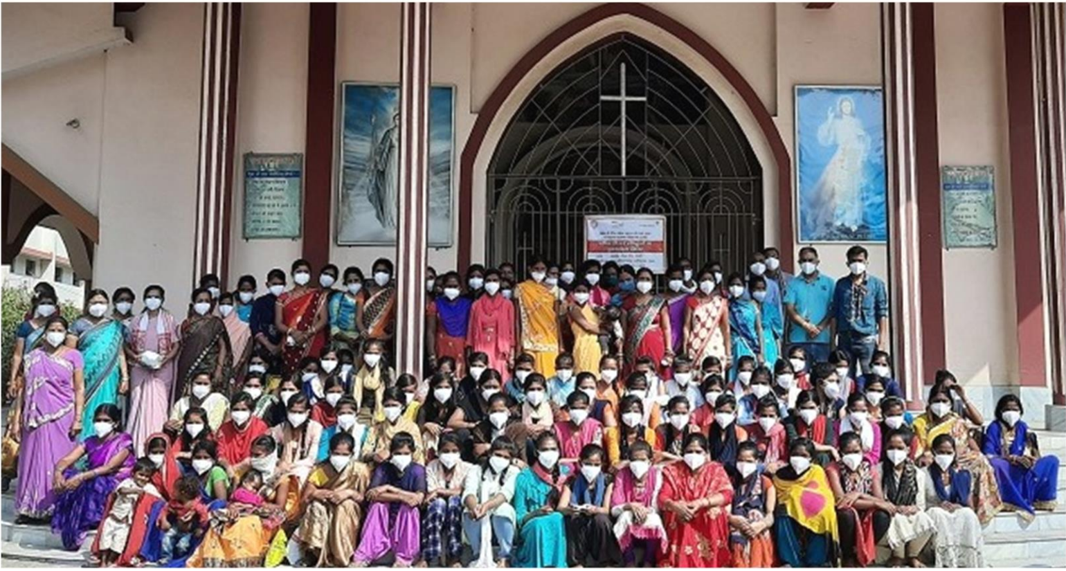
Voluntary Health Association Patna Team with the staffs and Tailoring Students of Navjeevan Social Center Hatnaut