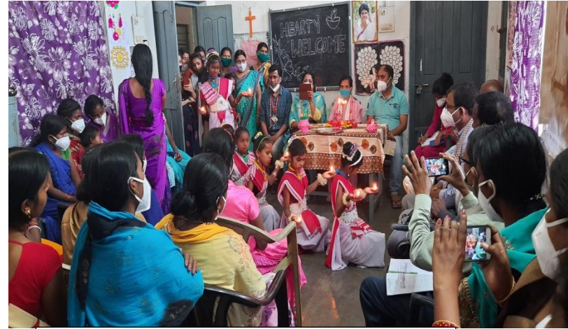
Welcome Dance by our students

Voluntary Health Association of Patna has brought 56 women from different villages to our tailoring centre as an exposure for their women to learn from our students. Our students gave them a grant welcome. They had very good interaction with our students. Our students shared their experience and also they have told us about their work. It was very enriching experience. We have learned from each other.