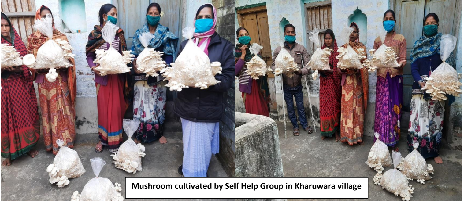
Mushroom cultivated by Self Help Group in Kharuwara village