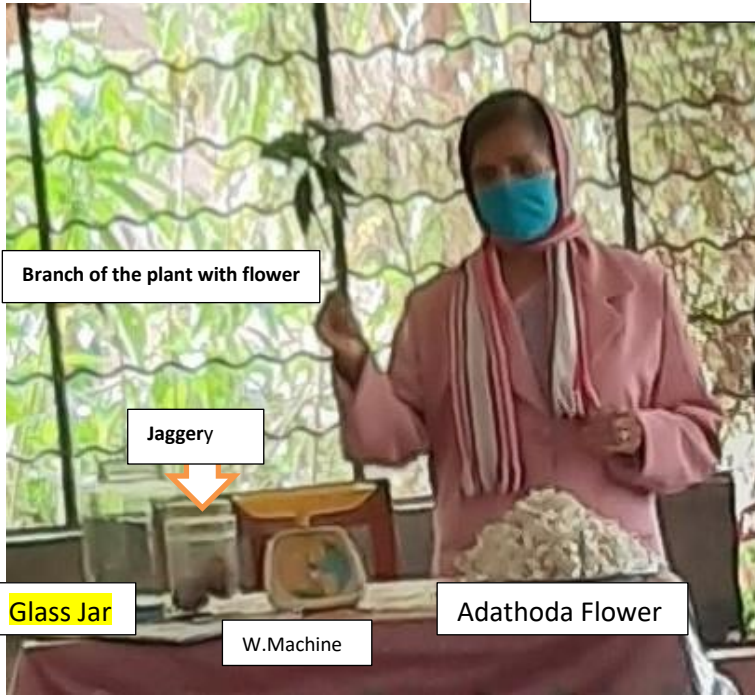
Branch of the plant with flower