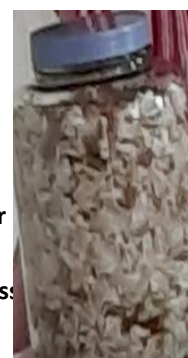
Filled Glass Jar

Weigh the jaggery and the flower one Kg each and place in a plate separately. Grinde the Spices and Keep in a plate. Then take the glass Jar and put some pieces of Jaggery in the Jar and put same amount of Flower on the top of the Jaggery again put Jaggery on the top of the flower. Like this place jiggery and flower in layers alternatively till the Jar is full. Place the spices also in between may be after two to three layers. Close the lid of the glass jar air tight. Keep it under the sun during day for 41 days. Your cough Syrup is ready. Strain and keep it in bottles. Dosage: 1 tsp. Three times a day for adult and ½ tsp. for children.