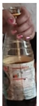
Cough syrup Made earlier