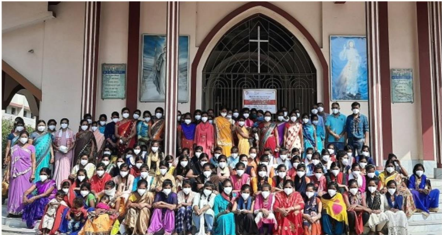
Voluntary Health Association Patna Team with the staffs and Tailoring Students of Navjeevan Social Center Hatnaut